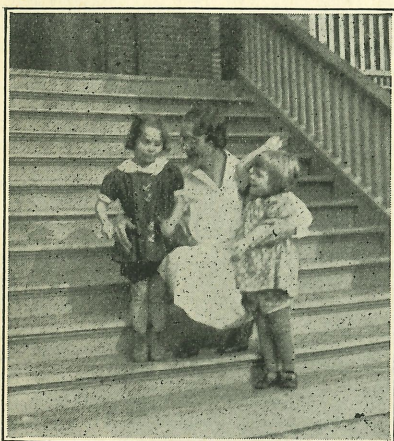
Deaf, yet Happy