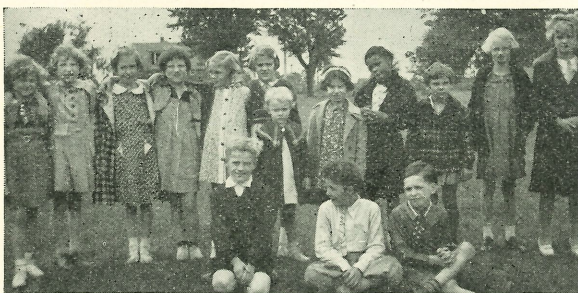
Some of Our Pupils