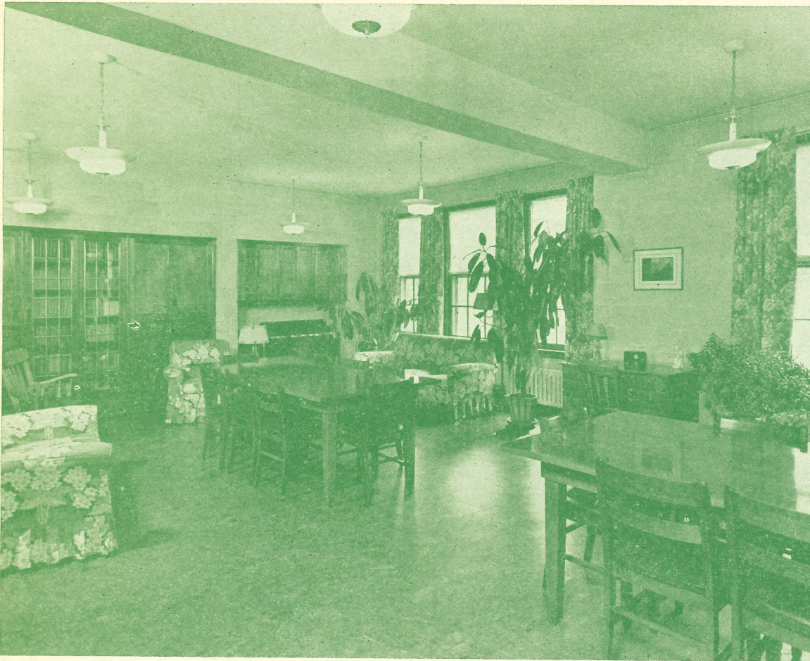
This is the living room for the older girls at our Institute. It is the gift of the Epiphany Ladies' Aid Society, Detroit, Michigan. This is where our older girls study and read.