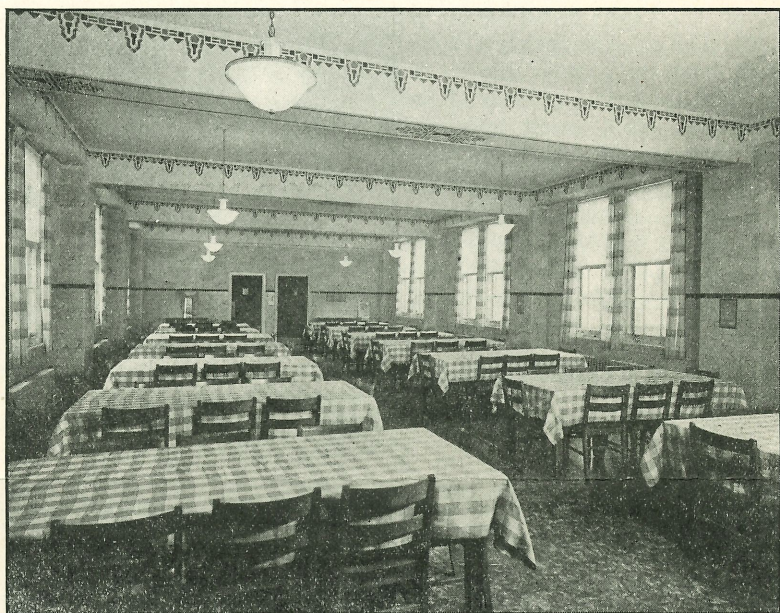
The dining hall