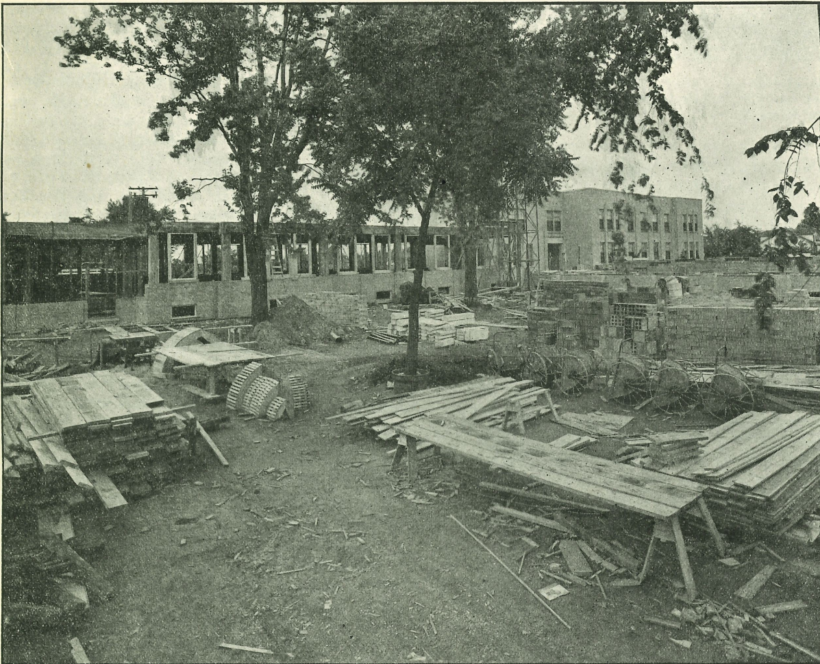
Construction is proceeding rapidly on the Administration Building and the Clara Elizabeth Knudsen Chapel