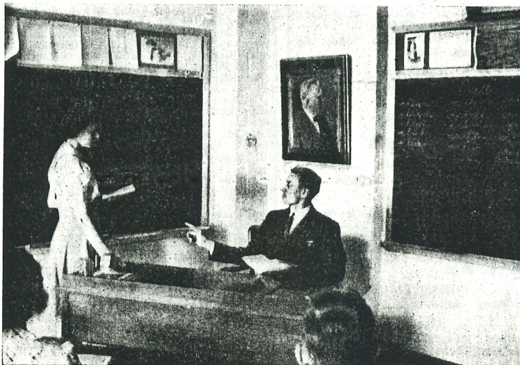
The C. Ruesskamp Room

"Entered as second-class matter December 13, 1930, at the Post Office at Cleveland, Ohio, under the act of August 24, 1912."