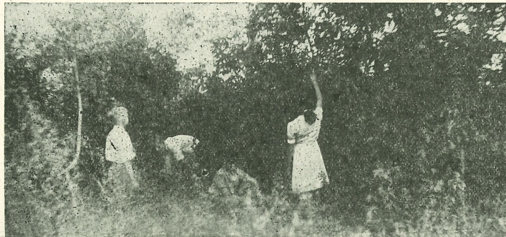
Our Wilderness Spot

In October we hope to receive some farm products from our good friends of the Thumb District and