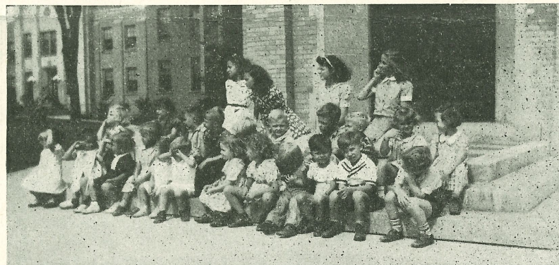
Our New Pupils

peal to our supporters. As you know, we send this mail to our readers of the Advocate only once a year. We do this because we want your good will. We want those offerings which you give from the heart. We want you to appreciate our Institute and to give us your gifts gratefully. And thus we also again say to our readers, "If every one of you will give us a gift of whatever size you will,