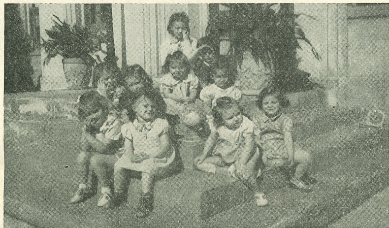
In the Last Rays of Summer

individual as well as group visitors. Their visiting our Institute evidences their keen interest in the Master's work and invariably results in a generous offering of love for the support of this Christian school for our handicapped little ones.