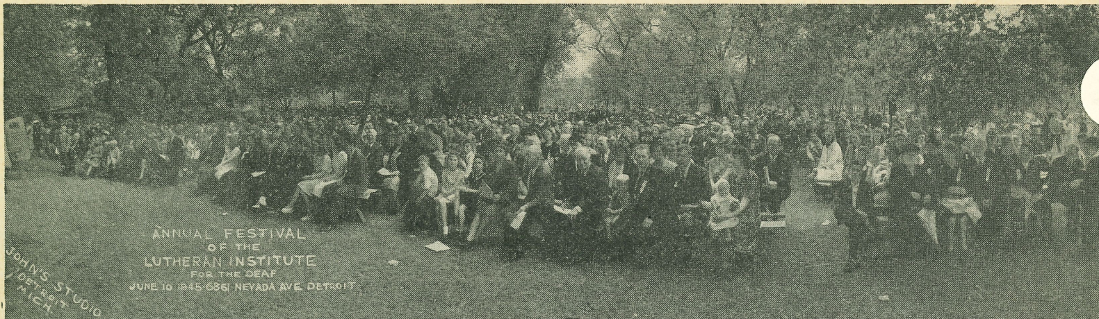
ANNUAL FESTIVAL OF THE LUTHERAN INSTITUTE FOR THE DEAF JUNE 10 1945 6361 MEXADA AVE. DETROIT

Part of the thousands who attended a previous festival. Fit yourself into the picture by attending this year's Diamond Jubilee Festival, June 13.