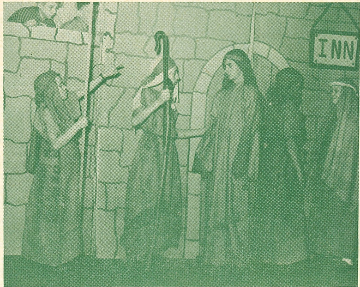
"For unto you is born this day, in the city of David, a Savior which is Christ the Lord." Luke 2:11

I give, devise and bequeath to the Society of the Evangelical Lutheran Deaf-Mute Institute, a corporation duly organized and existing under the laws of the State of Michigan, and located in the city of Detroit, the sum of .....dollars and the receipt of the Treasurer of said corporation shall be a sufficient discharge of my executor for same.