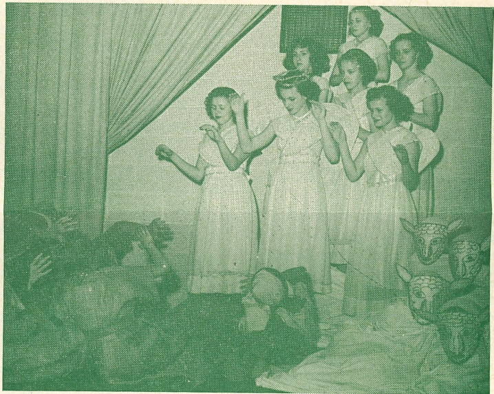
"There was no room for them in the inn." Luke 2:7