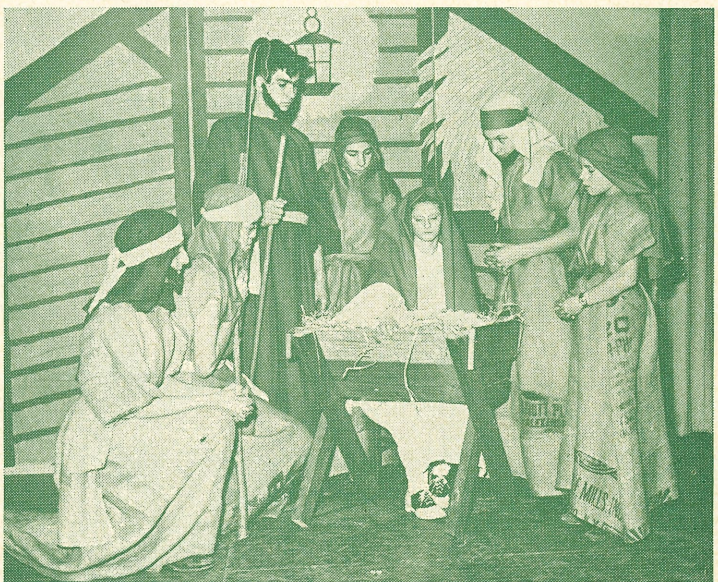
"And they came with haste and found Mary and Joseph, and the Babe lying in a manger." Luke 2:16