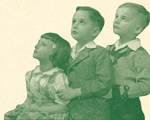
"Lord, teach us to pray"

A PROTESTANT RESIDENTIAL SCHOOL FOR DEAF CHILDREN