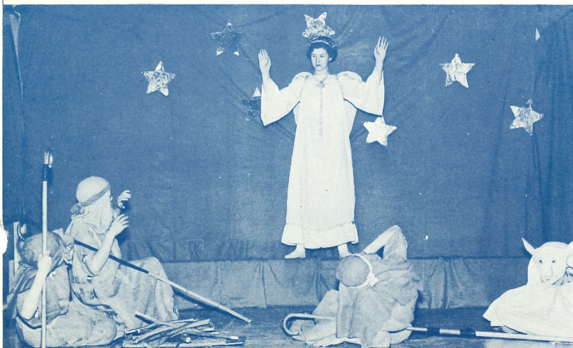
PUPILS PREPARE to portray the birthday of Jesus in their annual Christmas program to be held on December 20th.

ALL ADDRESS CHANGES must be sent to the Lutheran School for the Deaf, 6861 East Nevada Ave., Detroit 34, Mich.