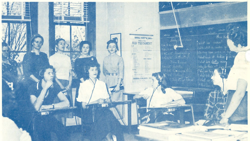
VISITORS ARE always welcome - Dashwood, Ontario Ladies charter a bus to see first hand how the deaf child is taught.