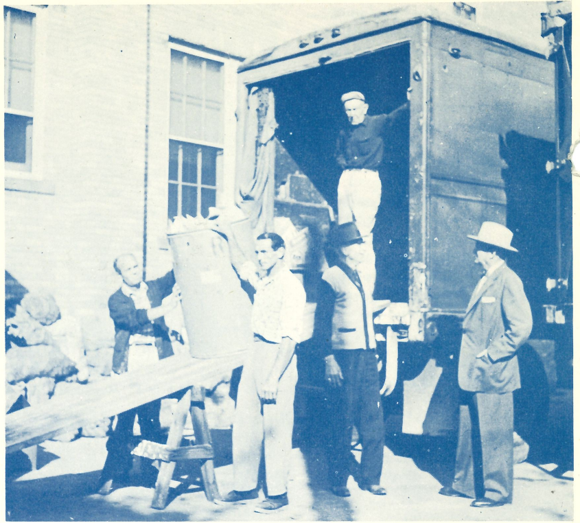
AND FROM within come bags, boxes and barrels of fruits and vegetables donated by our farm district congregations.