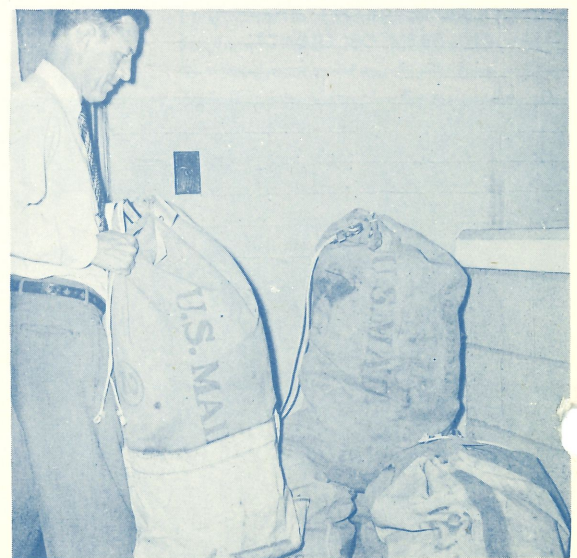
PRINCIPAL WALTER BELLHORN weighs and stacks the filled mail bags as the last operation before our Once A Year Appeal wings its way to your home.