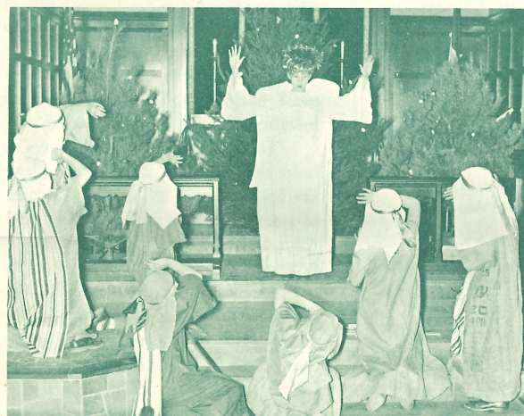
The good news proclaimed to the shepherds: "Unto you is born this day in the city of David, a Saviour, which is Christ the Lord".