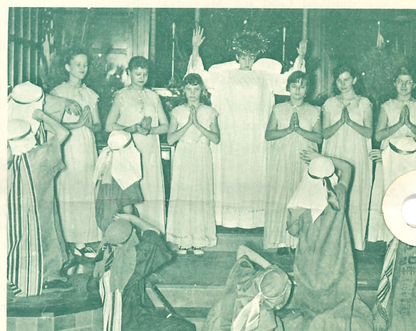
"And suddenly there was with the angel a multitude of the heavenly host, praising God and saying: 'Glory to God in the highest, and on earth peace, good will toward men'."