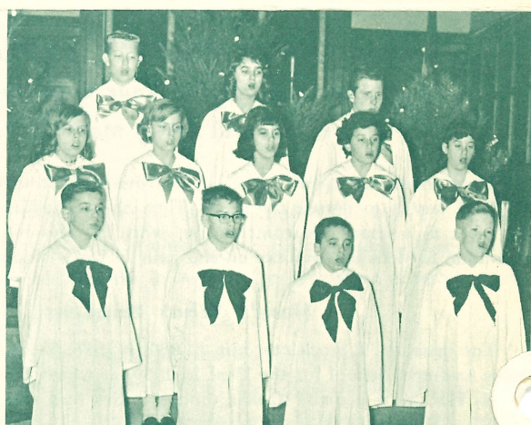
The deaf children's choir brings the beautiful Christmas story to a close with the singing of "Silent Night."