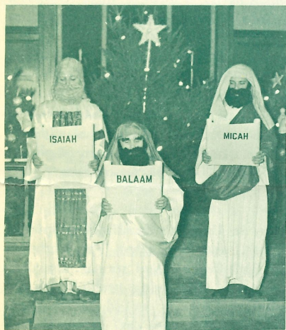
The Prophets foretold the blessed event. "Behold, a virgin shall conceive and bring forth a Son and shall call His name Immanuel".