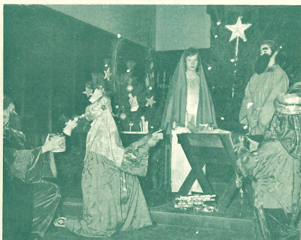
The wise men find Jesus — "They . . . fell down and worshipped Him: and when they had opened their treasures, they presented unto Him gifts: gold, frankincense, and myrrh."