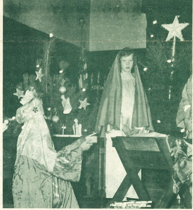
THE GIFTS OF THE MAGI

We are confident that every reader of The Deaf Child's Advocate will respond to our "ONCE-A-YEAR APPEAL," according to ability, with an offering which is so necessary for the continuance of the blessed missionary work for God's Children of Silence.