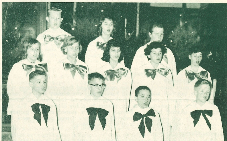
OUR DEAF CHILDREN'S CHRISTMAS CHOIR