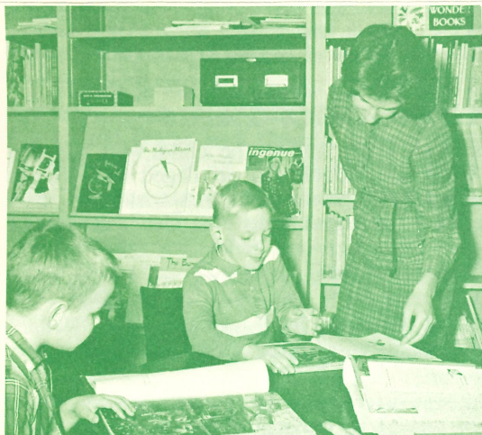
Teacher guidance in the library leads to . . . . . independent reading.