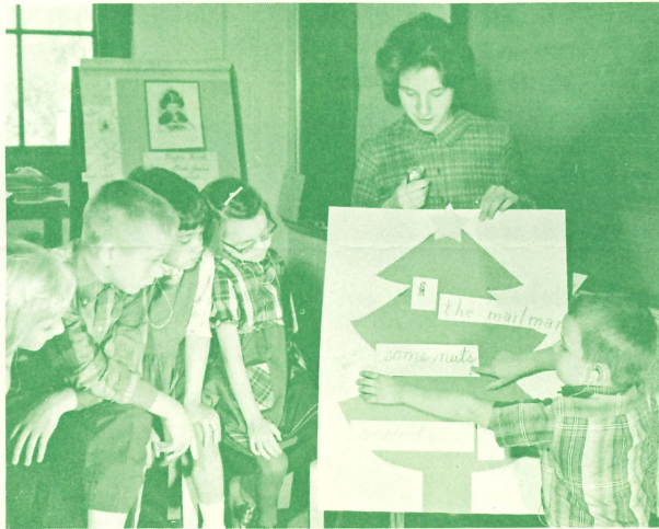
The matching of words to pictures is an essential of vocabulary preparation prior to reading a story.