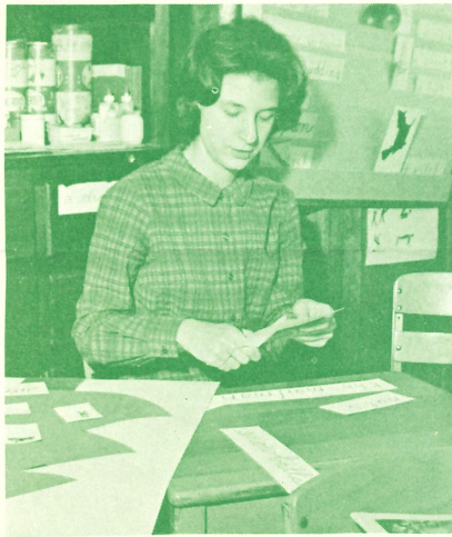
Many hours of teacher preparation of content and materials are necessary for an effective lesson.