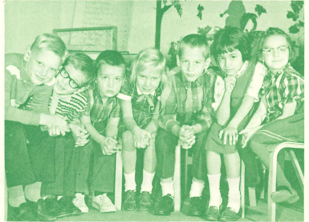
Interest in the activity clearly shows itself in the facial expressions of the children. This is also a clue to the teacher of their comprehension.