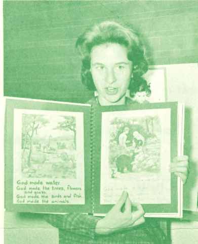
Guided group reading.