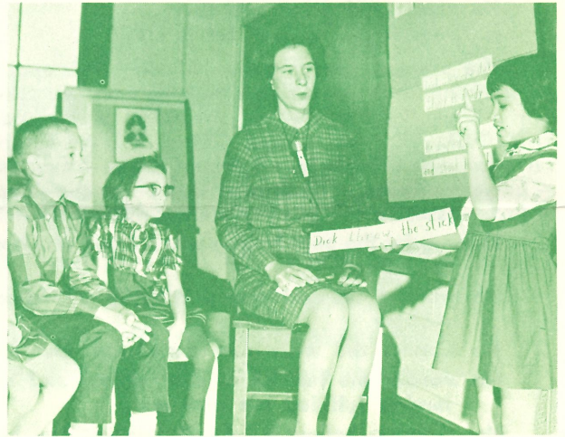
Recognizing the sequence of sentences within a short active story clearly indicates understanding.