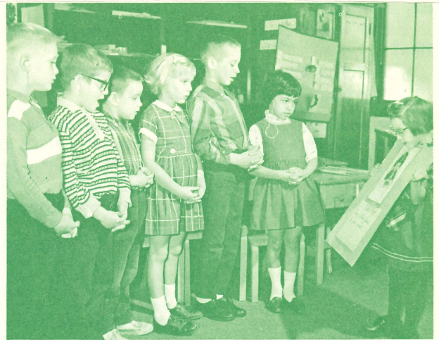
Prayers, a vital part of each child's life, begin with reading and lead to personal private use.