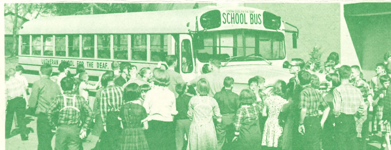
New Dodge bus. The excitement of the purchase of a new bus ran high. We could hardly wait for its arrival and, when it did come, a thorough examination took place. Our old bus of thirteen years finally succumbed to the winter's salty streets.

FRIENDS OF GREATER DETROIT To help us restock our pantry shelves, please REMEMBER POUND DAY!