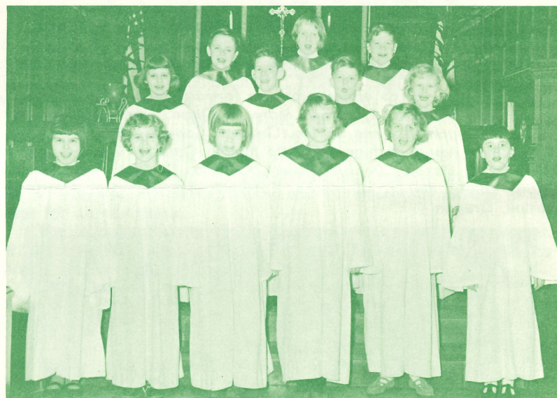
Singing the praises to Christ the King on the festive celebration in remembrance of His birth, is enjoyed by our younger choir as they begin rehearsal for the annual pageant.