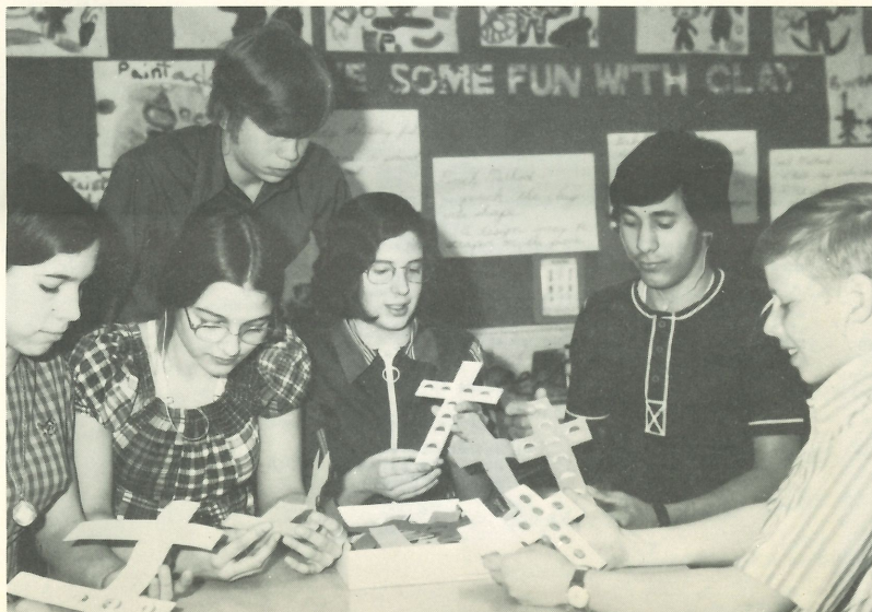
The Confirmation Class assists in opening coin folders made in the form of a cross and presented to the school as a centennial offering.

The receipt of the Treasurer or Executive Director of said corporation shall be sufficient discharge to my executor for same.