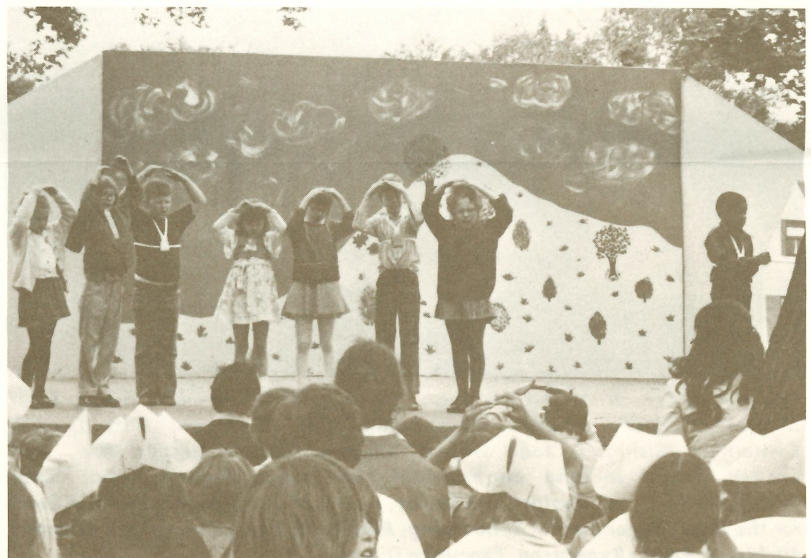
The "Eensy Weensy Spider" was portrayed in the words and finger play of the children of the Pre-Primary Departments.