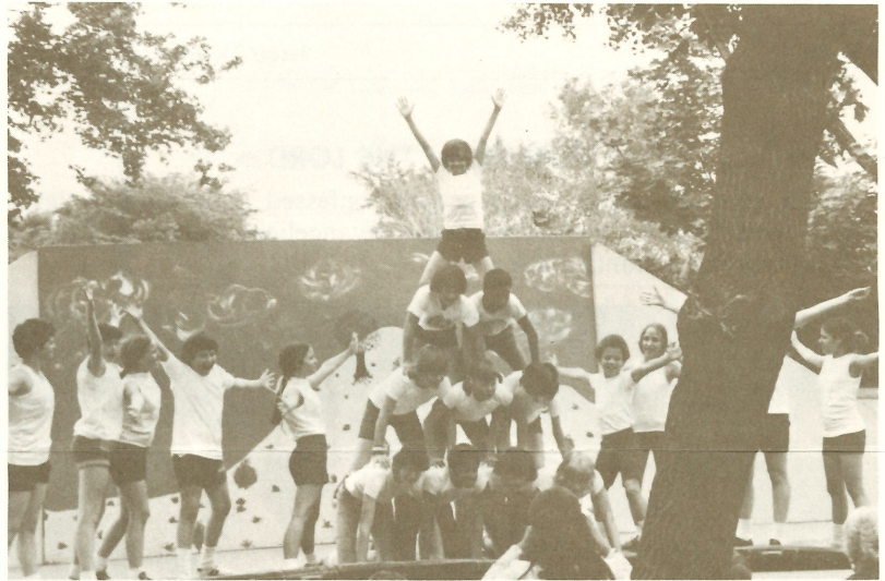
The Intermediate children demonstrated the human pyramid which they had learned during their athletic classes this year. We thank God for all of the blessings of the past year. We thank all of our friends who made this possible.