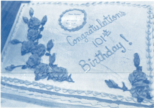
First year, second century