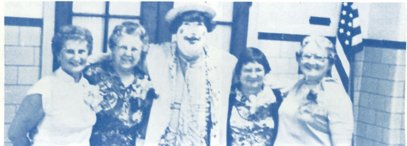
Members of the ladies auxiliary who served the dinner for the Lions