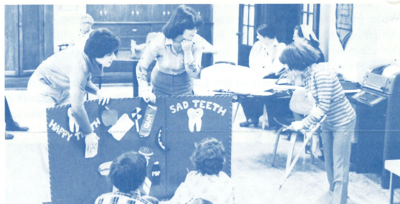
Dental technicians teach health care