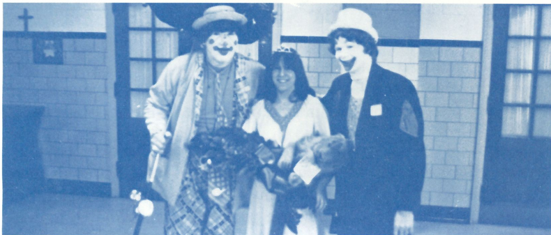
Shrine clowns and our queen