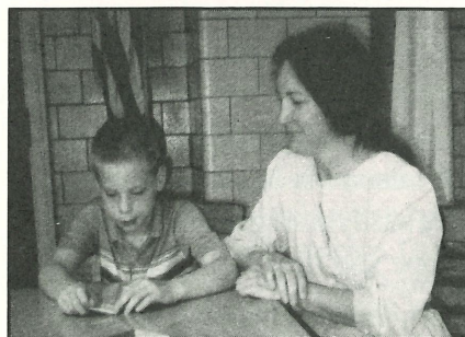
Testing: Testing helps us recognize this child's skills and compare them to God-given abilities.