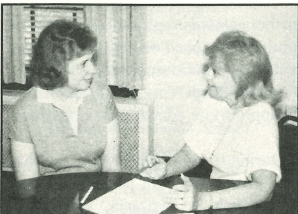
Interview: Evaluation procedures are explained and concerns are discussed.

Each of us serves God with the talents we have been given.