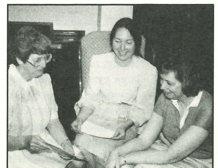
Possible ways to help are discussed with the parent.