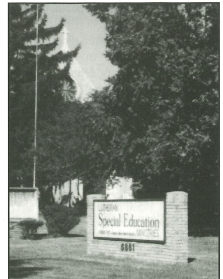
... Our campus today. (Chapel in background.)