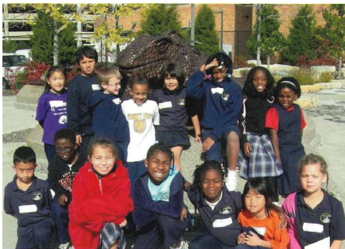
Students of Trinity First Lutheran School