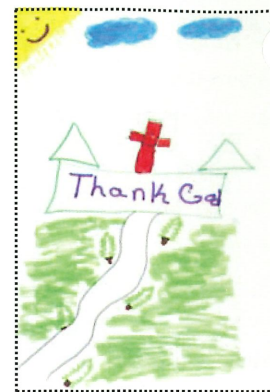
Handmade by an LSEM Student

We hope to continue with this tradition of handmade cards for many more years to come. We thank God for the blessings they bring not only to us but to you, our friends and partners in ministry!