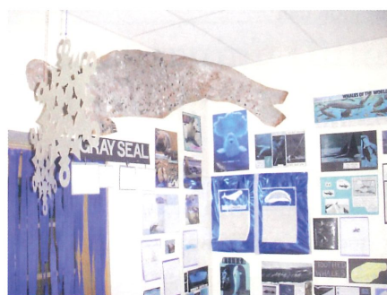
Life size replicas of arctic animals hang from the ceiling.