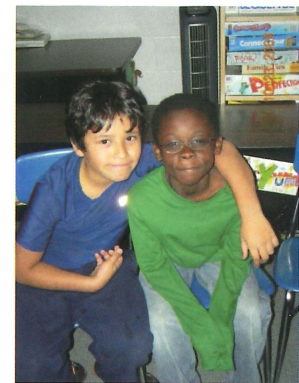
Students at Trinity First Lutheran School in St. Paul, MN.

Visit our website at www.luthsped.org for more information on attending or if you would like to exhibit .