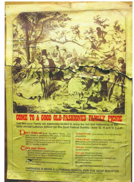
A poster advertising the 100 th annual Lutheran School for the Deaf Festival! 1873-1973